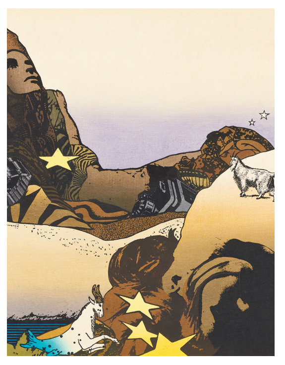
Capricorn, from Zodiac Landscape series, 1973, by Yoshida Hodaka (Japanese, 1926–1995). Photoetching and woodblock print; ink and colors on paper. Asian Art Museum, Museum purchase, Thomas F. Humiston Acquisition Fund, 2016.21. © Chizuko Yoshida.