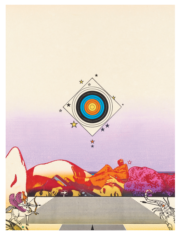
Sagittarius, from Zodiac Landscape series, 1973, by Yoshida Hodaka (Japanese, 1926–1995). Photoetching and woodblock print; ink and colors on paper. Asian Art Museum, Museum purchase, Thomas F. Humiston Acquisition Fund, 2016.32. © Chizuko Yoshida.