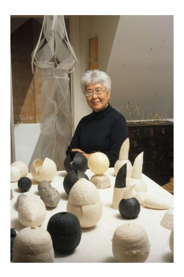
Kay Sekimachi (b. 1926– )