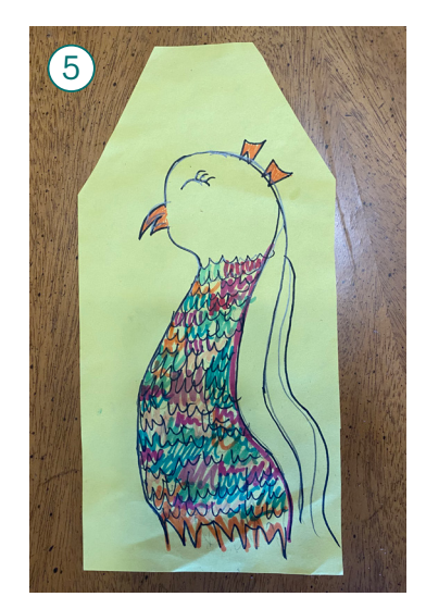
Color in your Amabie with the coloring pencils, using whatever colors you wish.