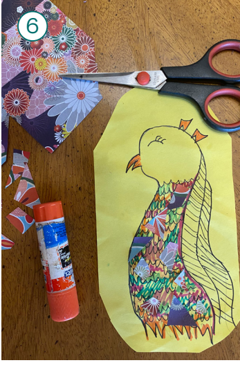
Optional: Cut shapes from printed paper to decorate your drawing.