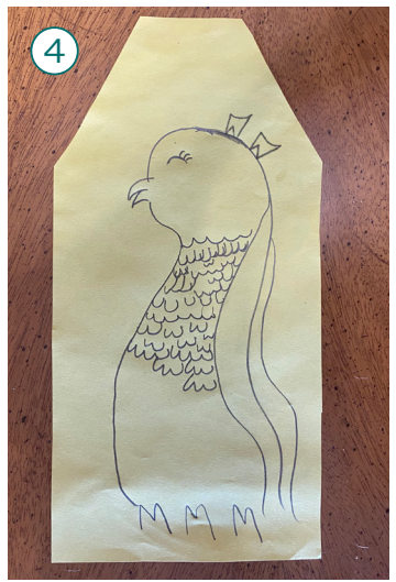
Add rows of "scales" for her body. Ears can be made with 2 sideways "w's."