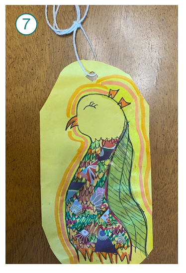
Trim your index card so that it is the size/shape you like, then punch a hole near the top of the card. Add a piece of yarn, string, or ribbon to hang your amulet. You may also decorate it further with glitter or highlight markers.