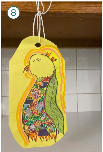
Tie your Amabie amulet on a doorknob, a window latch, a backpack zipper wherever she can brighten your day!