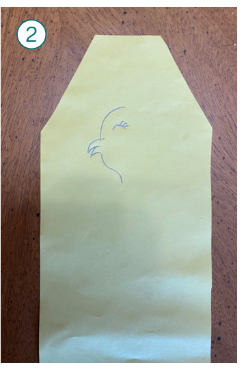
Start to draw Amabie on your index card. Begin with her face, making sure to include her beak.