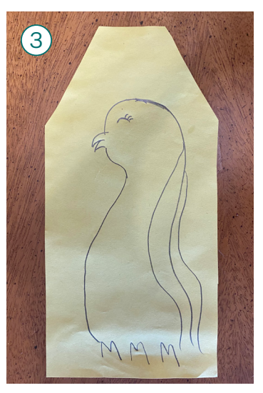
Add long hair that falls down to where you think her feet should be. You can use 3 upside-down "w" shapes for her feet.