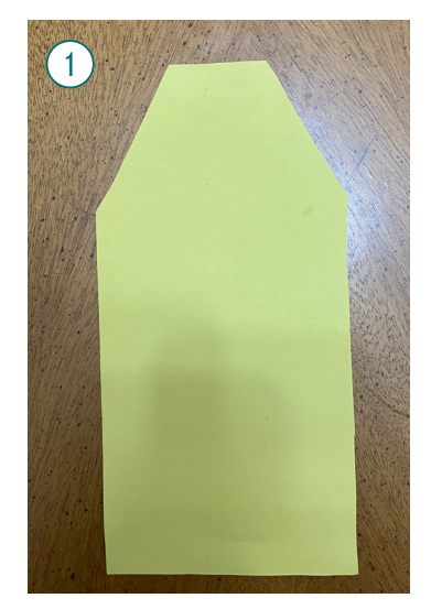
Start with an index card of any size. Trim it down so it matches the shape above.