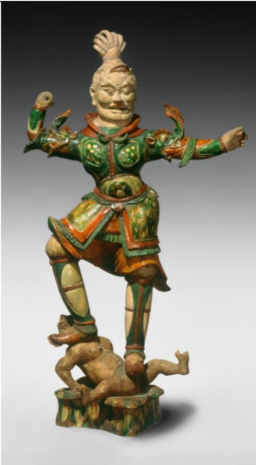
Tomb guardian, one of a pair Place of Origin: China, Shaanxi province or Henan province Historical Period: Tang dynasty (618-907) Materials: Glazed earthenware Credit Line: The Avery Brundage Collection Object Number: B60S155+

Remember: Your tomb guardian needs to be strong and fierce to keep unwanted spirits out of your tomb and keep your tomb objects safe.