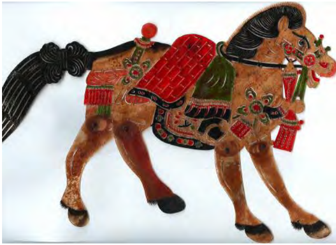
Xuanzang's Horse, 2005. China. Shadow puppet, pigments on hide, Donna Kasproicz Collection