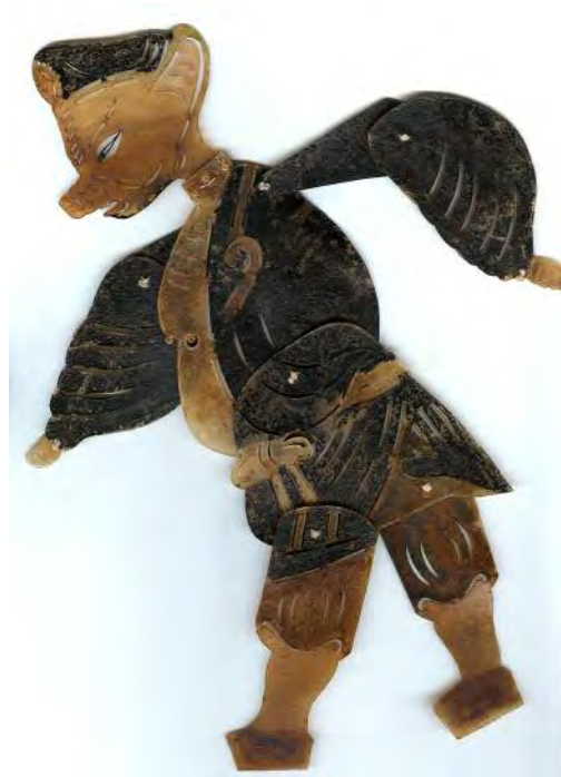
Pigsy, 2005. China. Shadow puppet, pigments on hide, Donna Kasprovicz Collection