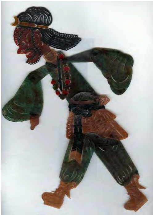
Sandy, 2005. China. Shadow puppet, pigments on hide, Donna Kasprovicz Collection